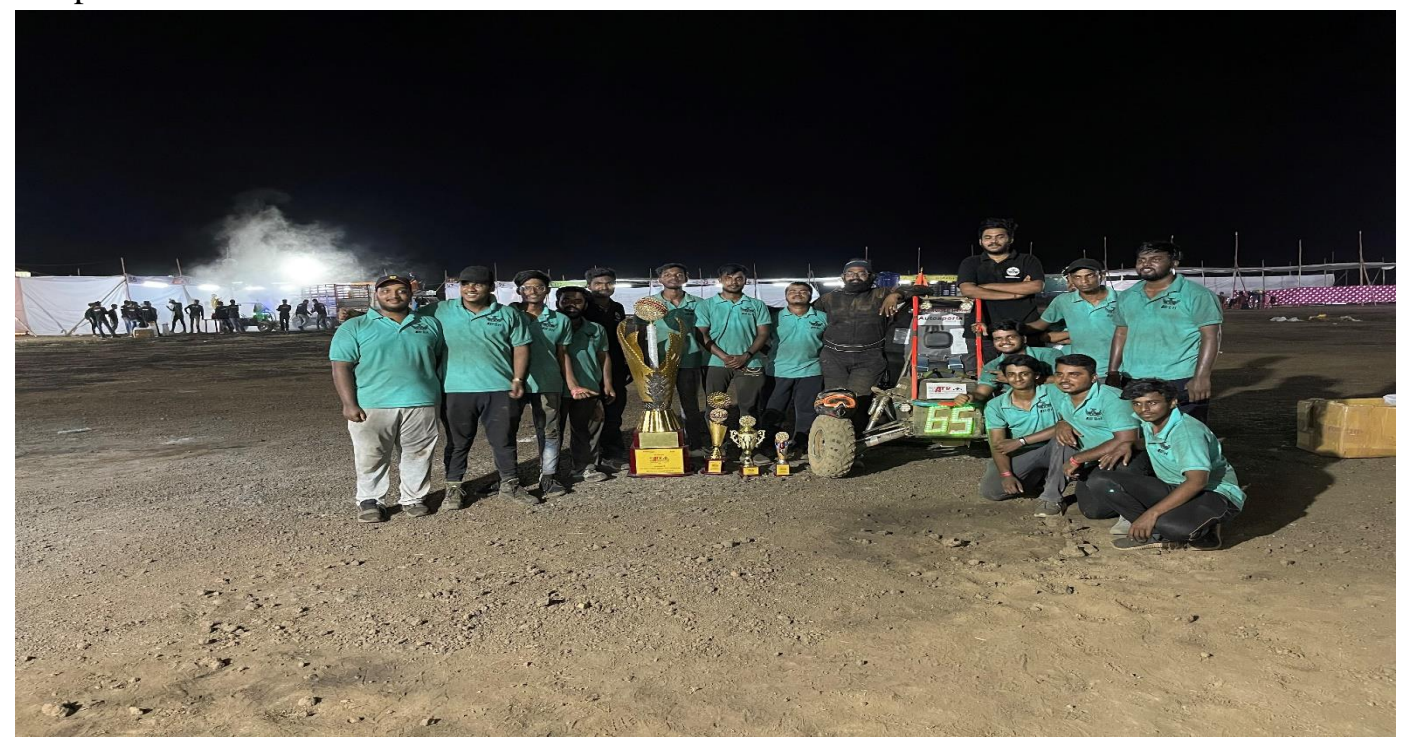
Mega ATV Championship 2021 team after winning (at the event place Goa)

We achieved 1<sup>st</sup> position in the event out of 65 teams. We will be striving hard to maintain this position.