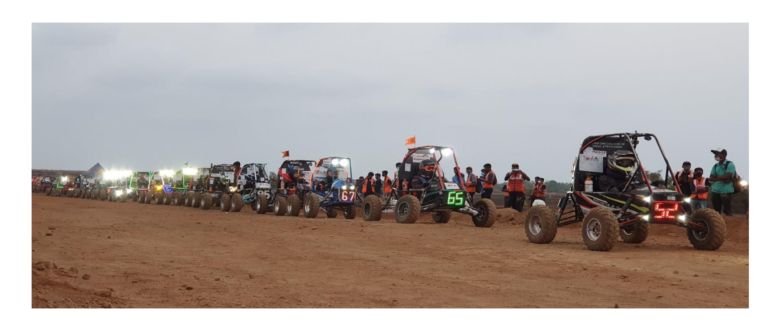
DAY & NIGHT ENDURANCE